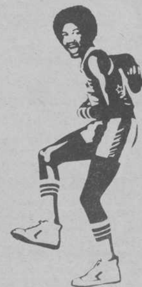
The last Trotter loss came during the 1970-71

had an overall record of 14,267 wins against 331 losses - for a .991 winning percentage.