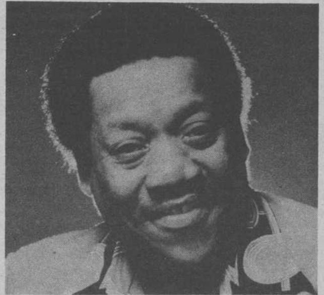
BOBBY BLUE BLAND