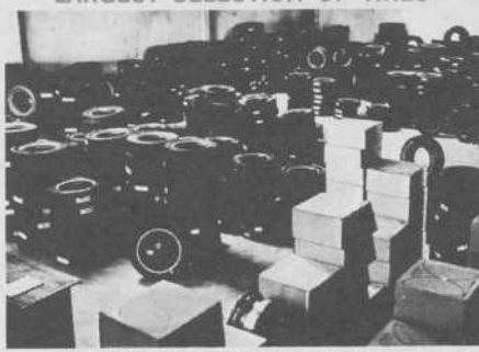
FIND YOUR SIZE & TYPE ON PRICE SHEET