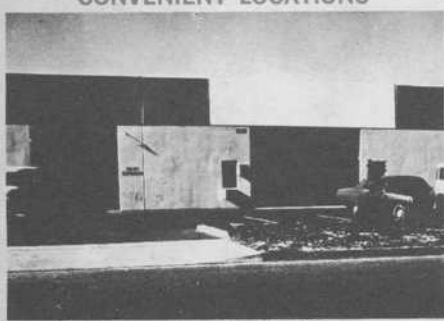
SEE BACK COVER FOR LOCATION NEAREST YOU