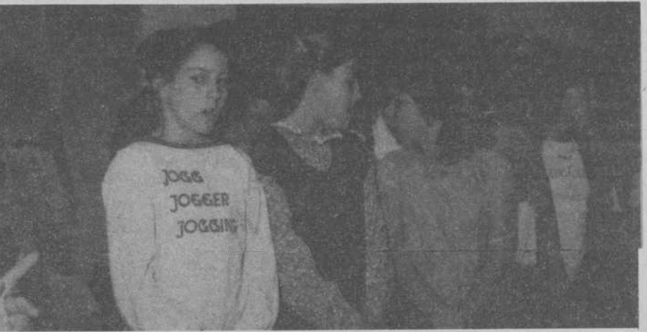
SIXTH GRADE students provide entertainment for seniors.