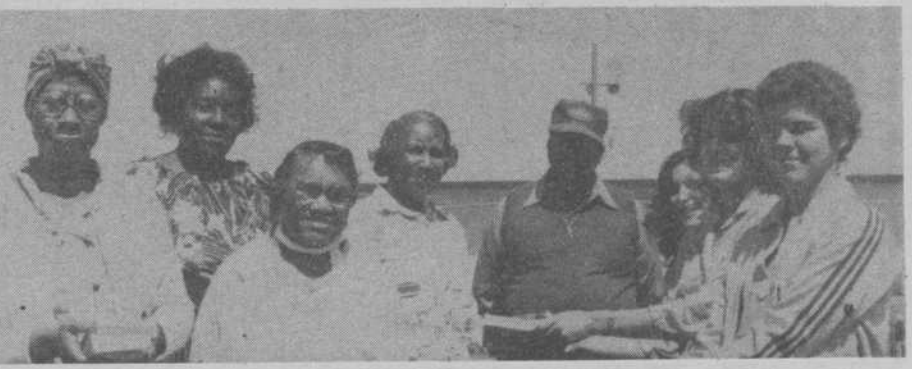
E.O. B. Senior Citizens receiving books from the book drive.