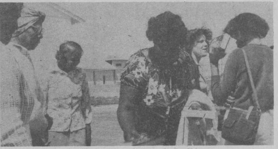
"I will read this one," sites a Senior Citizen.