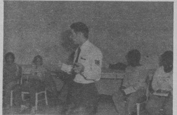
KEYNOTE SPEAKER addressing students on the subject of drugs and related problems.