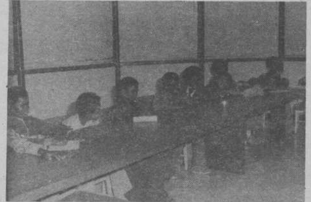
GROUP DISCUSSIONS can be meaningful.