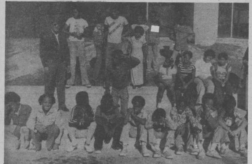
TOURING THE BASE can be interesting and informative. However, a few tired feet were experienced afterward.