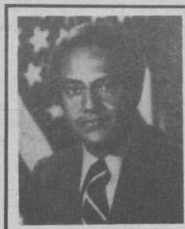
Patricia Harris, Secretary of Health and Human Services Clifford Alexander, Secretary of the Army