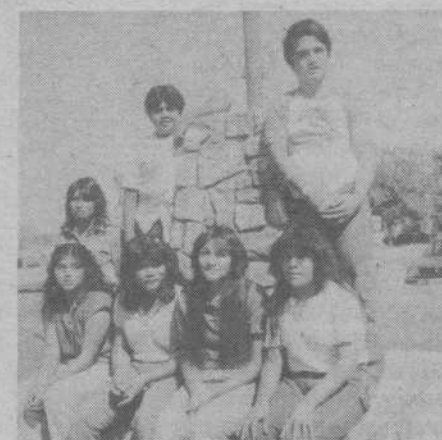
Indian Students, Moapa Valley High School