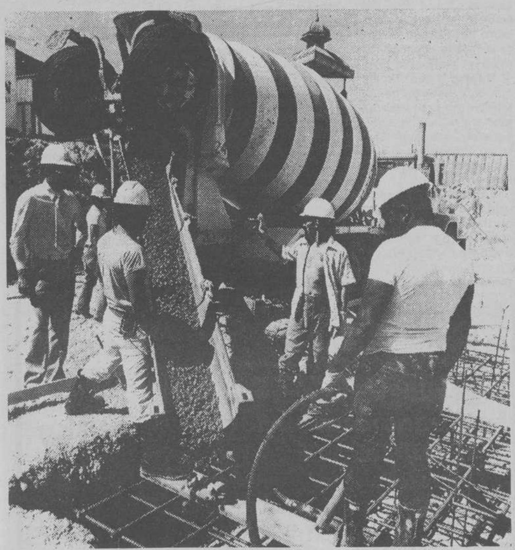
PROGRESS — Jim Roberts, left, project manager of First Western Savings new headquarters, watchers workers pour concrete footings of the $10 million building at West Sahara Avenue and Rancho Drive. The five-story building is scheduled for completion in October 1981.

The community must now come to the rescue and wipe out this deadly threat with positive action and through the proper aggressive unification of community resources to "kill" this germ.