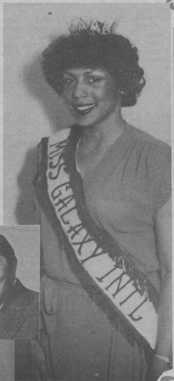
Miss Galaxy International