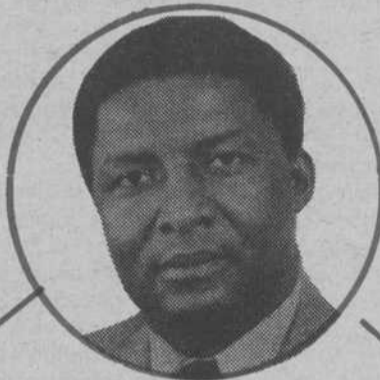
State Senator Joe Neal