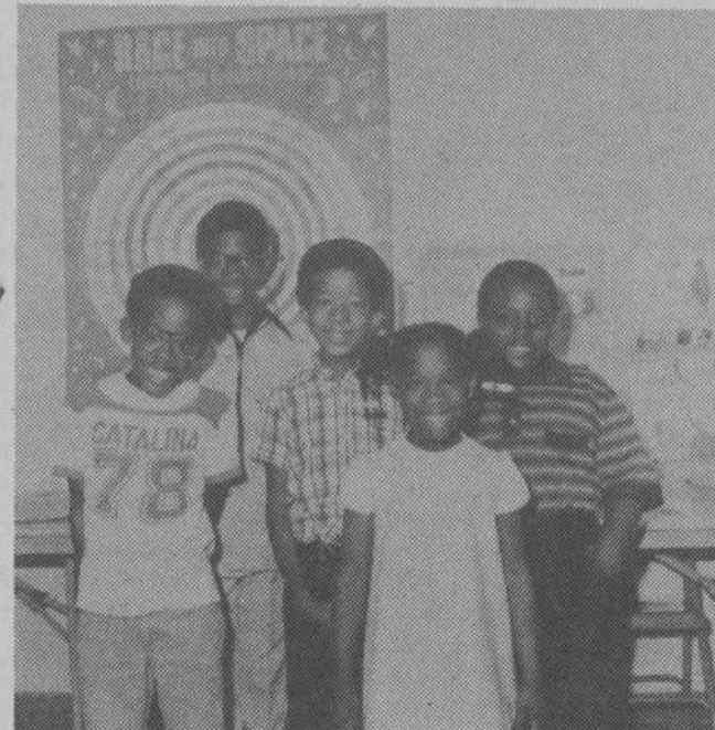
Children from the Pentecostal Temple Church of God in Christ Vacation Bible School.

COME JOIN US. Let us have and teach your children about Jesus. We are dedicated to the services of God and we are excited about Vacation Bible School. "Jesus, I believe in You."