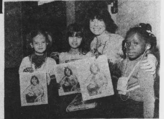
STUNTWOMAN VISITS DEAF SCHOOL Acclaimed stuntwoman Kitty O'Neil, totally deaf since birth, is shown distributing autographed photos to students at Ruby Thomas School for the Deaf. O'Neil took advantage of an off-day from the set of the movie, "Smokey and the Bandit II," being filmed in southern Nevada, to spend some time with the students. The veteran stuntwoman was recently featured on a nationally televised "Guinness World Records" program during which she performed a record-breaking one hundred foot free-fall dive from a hovering helicopter, onto an inflated air cushion.