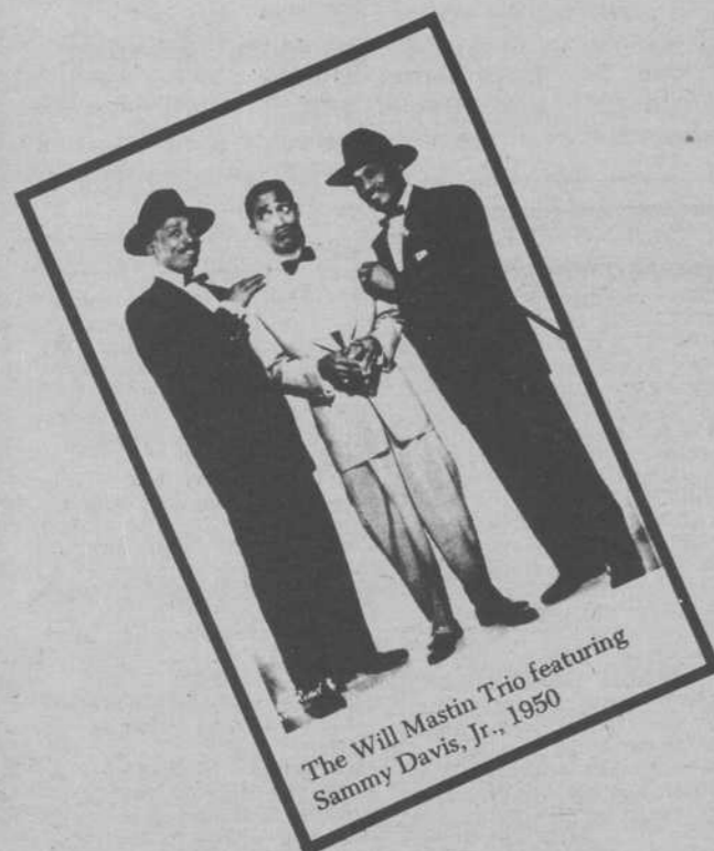
The Will Mastin Trio featuring Sammy Davis, Jr., 1950

When Pearl Bailey first came to Las Vegas the year was 1941. Upon exiting the train she went inside a nearby establishment "and played the machines". The policy of segregation had not yet reached all hotels and casinos in Las Vegas. She reminisces, however, "that a few years later 'people of race' were barred".