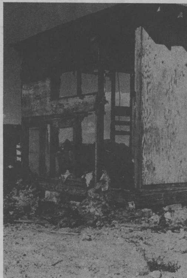
ALL THAT'S LEFT

After hours and Saturdays & Sundays Call 382-0463 E-Z PAYMENTS...100% FINANCING AVAILABLE QUALITY BUILDERS, Inc. 5115 S. INDUSTRIAL RD., NO. 506