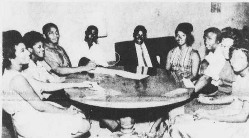
16 YEARS AGO THEY LOOKED LIKE THIS:

SUPPORT THE BLACK COMMUNITY NEWSPAPER SUBSCRIBE TO THE LAS VEGAS VOICE