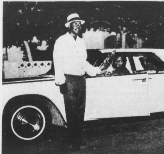
THE JOY OF A DAY SOME 16 YEARS AGO