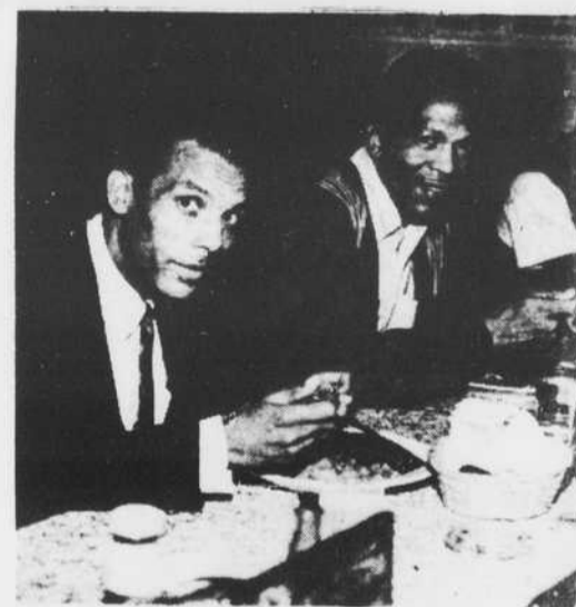
PLEASE TURN BACK THE HANDS OF TIME FOR ME

I'm glad that's all you caught him doing because there's no telling where you'd go then.