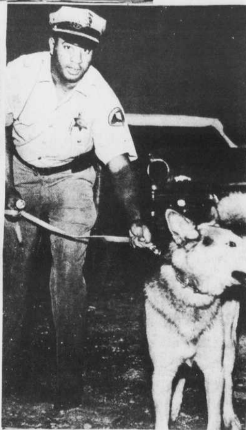
16 YEARS AGO A MAN AND HIS DOG