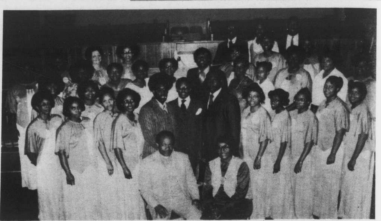
HALL SINGERS with the ST. PAUL CATHEDRAL CONCERT CHOIR as they will appear at the Annual Benefit Banquet & Concert, presented by The St. Paul Church Of God In Christ, Sunday, September 30, 1979-2:30 p.m. at Paul Anka's Jubilation Steak House & Restaurant, 75 East Harmon. Dinner is scheduled for 2:30 and the live recording concert will be presented at 3:30 p.m. Golden donation (includes dinner, Concert, Album & Picture) is $15.00 Silver donation, for dinner & Concert, is $10.00. All donations are tax deductible.