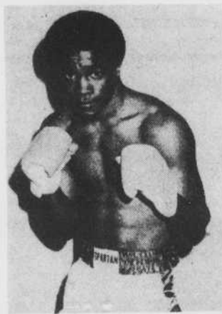
SUGAR RAY LEONARD