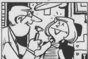
Your eyes have it—a key to your health.

That twinkle in "smiling eyes" or the malaise of an "evil eye" may often, like most folklore, reflect more truth than poetry—particularly to a medical eye physician.