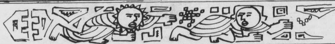
The Incas once believed that a jealous sun threw ashes at the moon so she would have no rivals in the sky.

For free booklets about the Britain and Europe '79 tours, write to Air India, Dept. GB/E, 400 Park Ave., New York, N.Y. 10022.