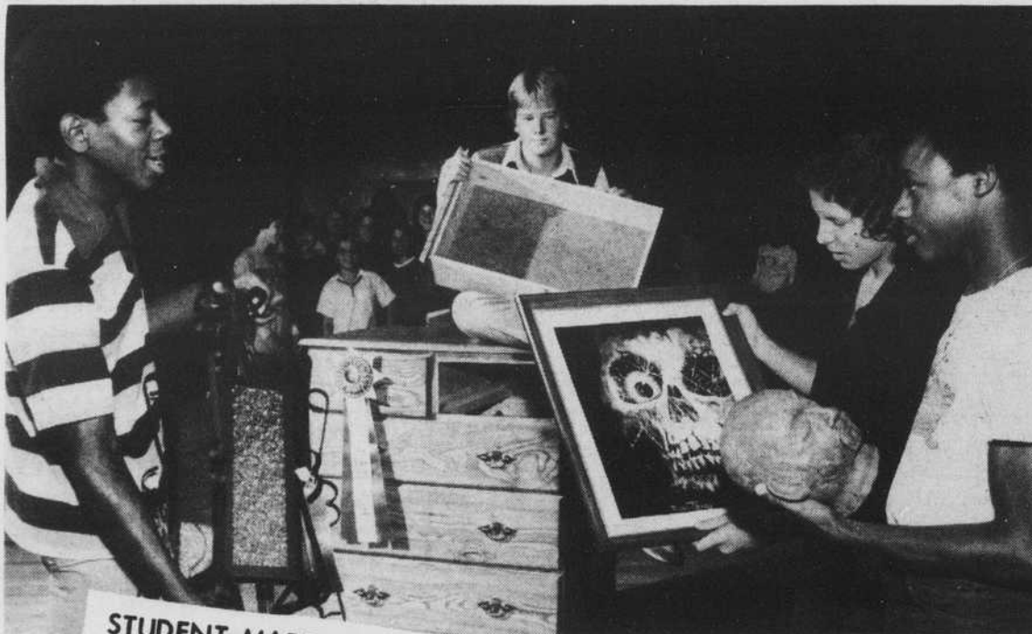
STUDENT-MADE CRAFTS ON DISPLAY