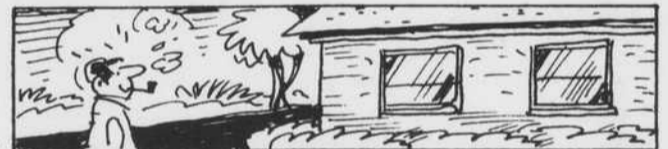
Weatherstripping all windows not painted shut or airtight can lower your total fuel bill by a high percentage.

The New York Urban League is a private, non-profit, non-partisan, interracial organization which works on behalf of Blacks and other minorities in New York City in the areas of employment, education, housing, health and welfare.