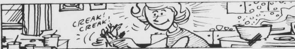
When buying artichokes, rub one against the other. If they squeak, they're fresh.

It can help make your living room the heart of your home, without making your savings take a beating.