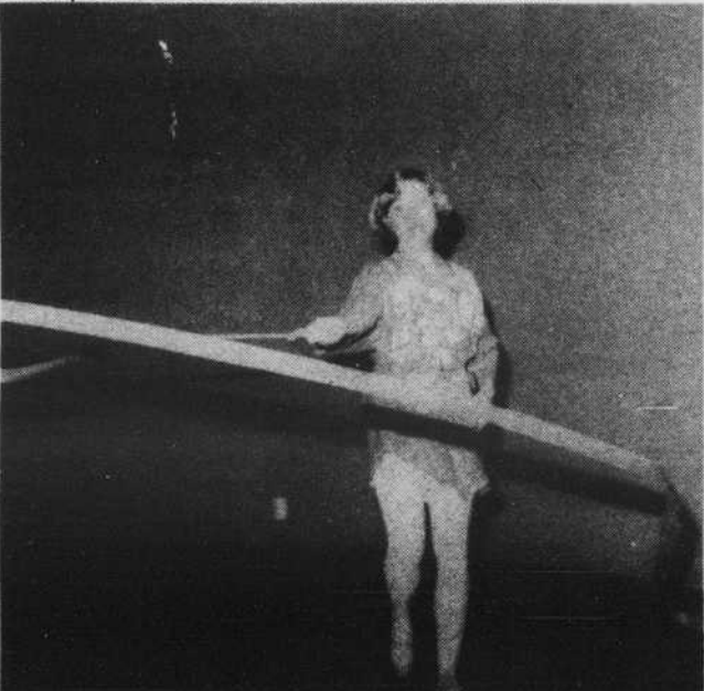
Oriental Ribbon Dancer performed by a UNLV student.