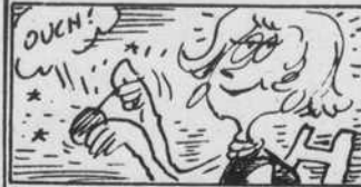
Some used to say piercing a lime causes love pangs in one's beloved.