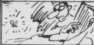
Some say it's a sign of rain to see lightning bugs flying high.