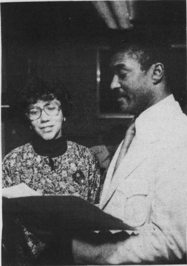
MADISON SIXTH GRADE CENTER