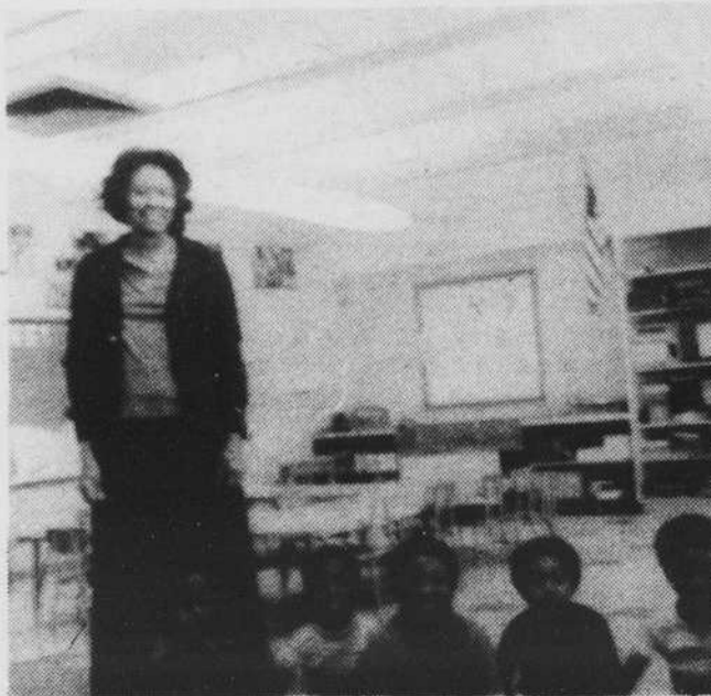
MATT KELLY SIXTH GRADE CENTER