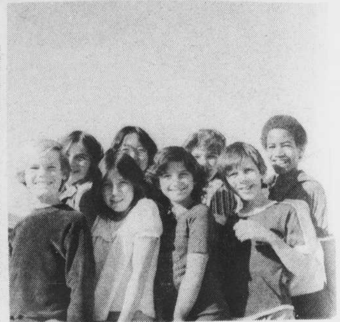
QUANNAH MCCALL SIXTH GRADE CENTER