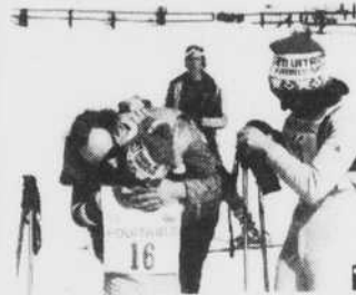
WARMING THE HEARTS of family skiers is the Equitable Family Ski Challenge — a national event for parent/child teams.

Family skiing is getting a lift from the Equitable Family Ski Challenge, which for the third straight year is bringing family teams from all over the country into competition with each other.