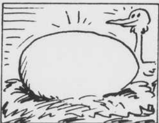
Ostrich eggs are the largest bird eggs. They may be eight inches long and weigh three pounds.