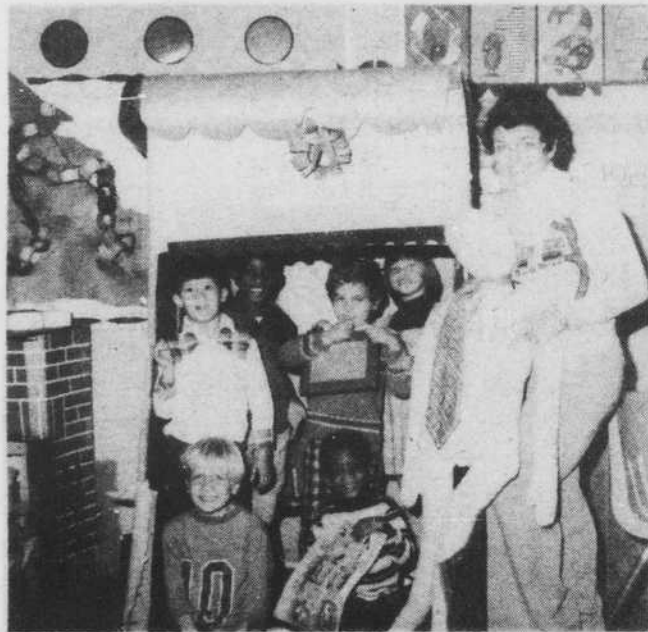
S.L.I.C. Class for six year olds is new to Red Rock School this year. The six children shown with their friend "Mr. No-Body", are continually exposed to a variety of child centered activities and experiences in areas of language auditory, usual, kinetics perception, motor, social, early academic, and general communication skills.