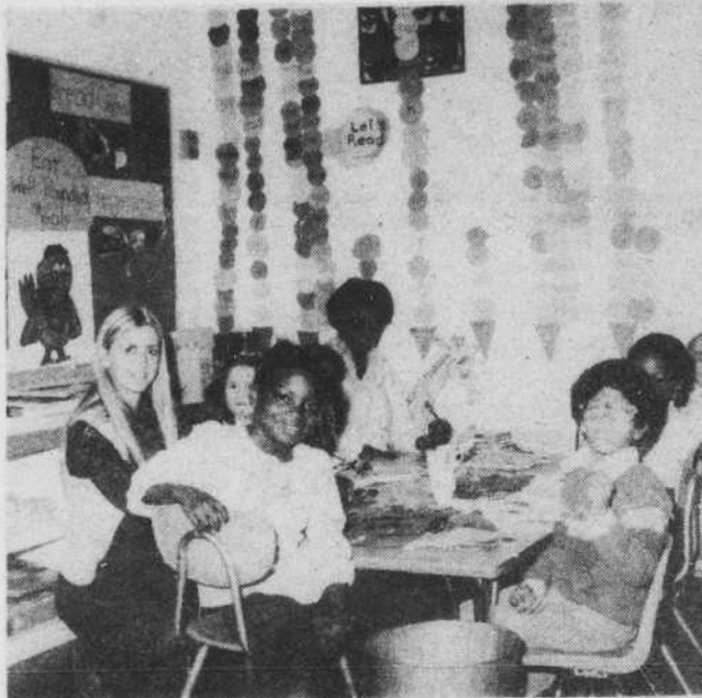
emic skills and look forward to increasing success in the regular classroom environment.