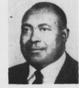
Family Counse 382 4351