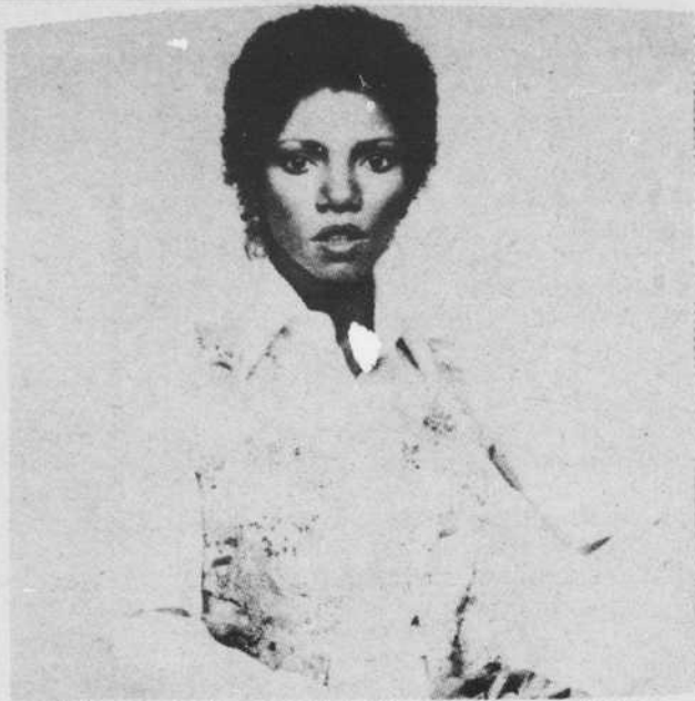
Epic recording artist Melba Moore will appear on the nationally televised "Super Bowl Saturday Night". In addition to performing her chartmaking single, "YOU STEPPED INTO MY LIFE" (from the current hit album, "MELBA"), she will also perform the show stopper "TOMORROW" from the Broadway musical Annie. Sports personality O.J. Simpson will host the show and it airs Saturday, January 20th on NBC TV. Bob Hope, Telly Savales and Johnny Carson are others Scheduled to appear.