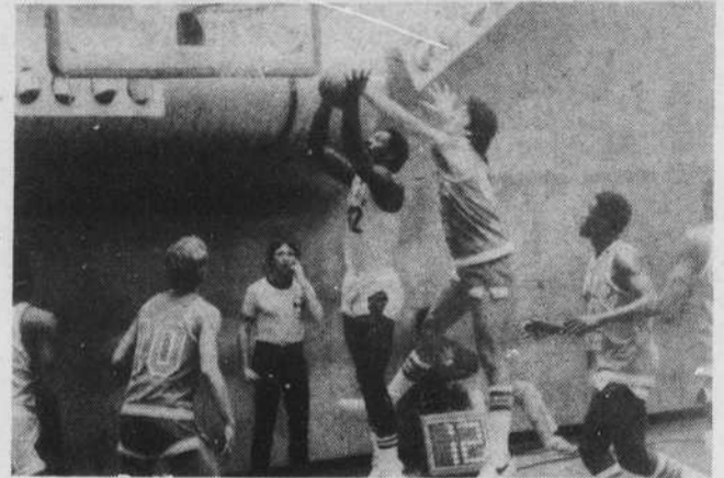
#42 makes a Layup look easy.