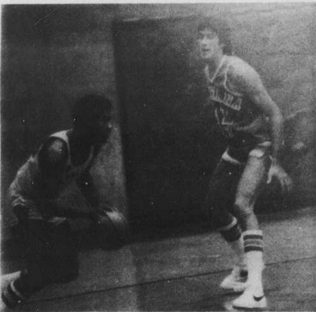
Dealer player dribbles past Montana Sky Player.