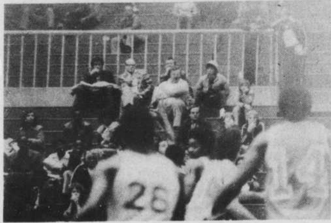
My! Let's put the ball in the basket and not in the stands.