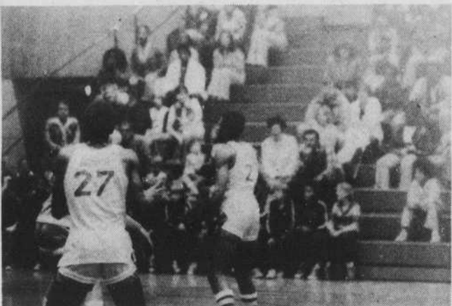
A near capacity crowd cheers The Dealers on to victory.