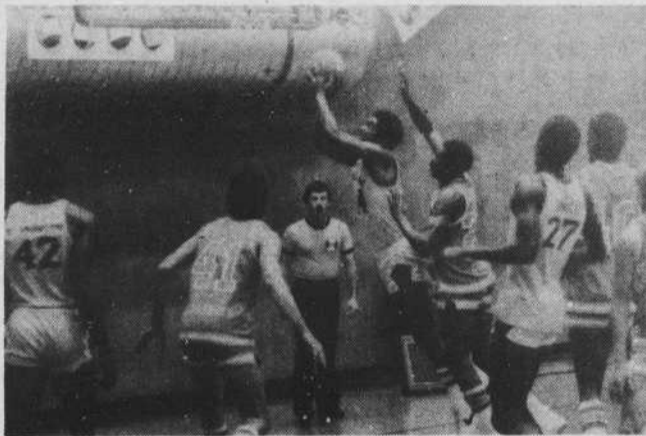
Dealers #24 goes in for 2 points.