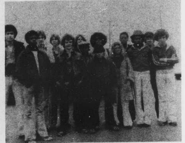
Students pictured here are a part of a Behavioral Modification Program, at Jefferson, Biltmore and Washington schools. These schools have a weekly program where outstanding students are selected by teachers, and are awarded for their effort. There are certain goals to be met, before being selected. A student has to show outstanding performances, before becoming part of this selected group. There are several awards presented, one is a certificate of merit. Many students have been motivated by this event, and for them it has also been a great experience.