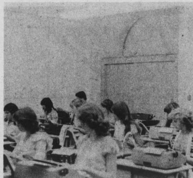
Business Class, Activity Shot.