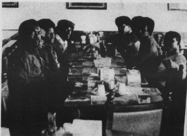
Well, you know we have to eat too, this is one of our things. Thanks to the Human Relations Office who made this trip possible for us. And now I am on my way to college. How about you?