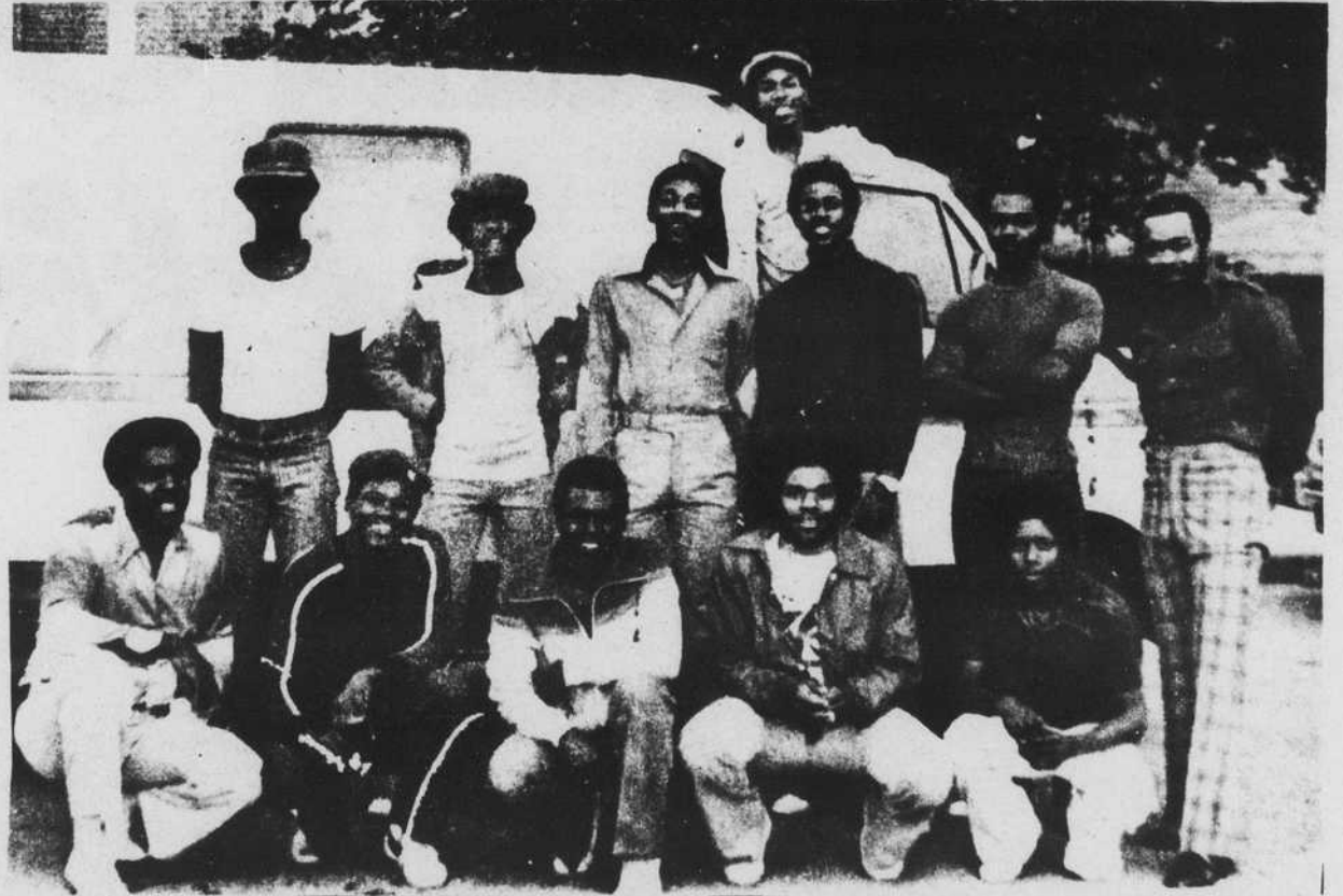
Students enroute to Victorville, California to visit Victorville Community College. Getting motivated to attend college.