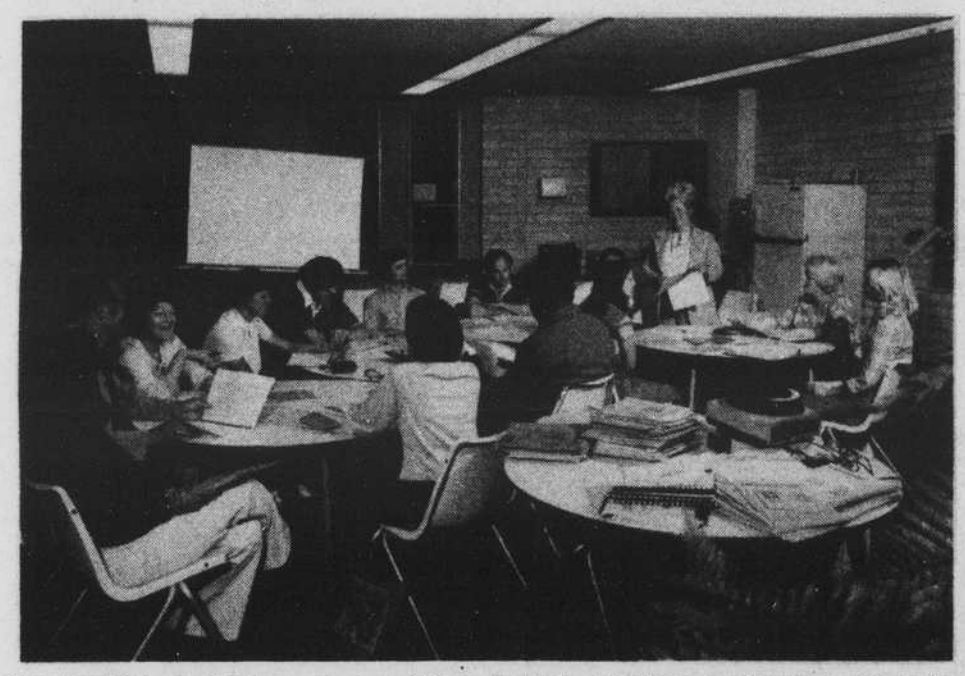
TEACHERS LEARN - Junior High School Reading and Language Arts teachers receive in-service training at Von Tobel Junior High School as part of their training for the Language Arts Management System. Special training sessions were scheduled at each junior high school in Clark County.