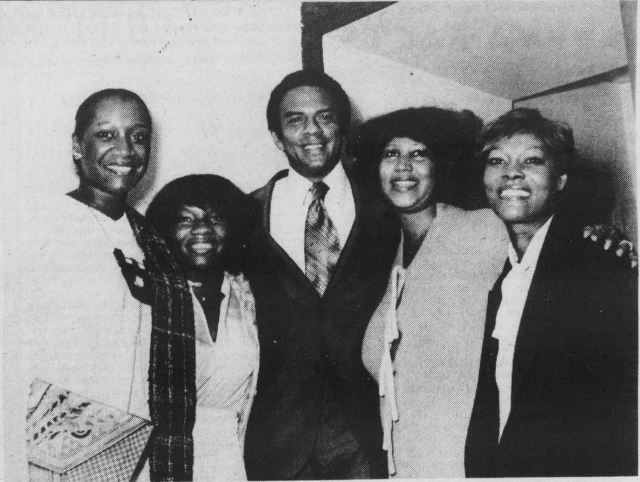
Andrew Young, the charismatic US Ambassador To The UN, was surrounded by talent after Aretha Franklin's recent performance at New York's Carnegie Hall. Whooping it up

New construction and reconstruction consisting of right-of-way acquisition, pavement, traffic control devices, drainage facilities, curb, gutter and walk to provide four travel lanes.