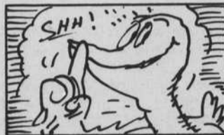
The mute swan is so-called because it is said never to use its voice in captivity.

of communication. Your biggest social activity is indicated in the business realm. Even if you are only an auxiliary principal, you will play an active part and be caught up in the excitement of the big event of the month. You are in a position of power and want others to see it. AQUARIUS — January 21-February 19 There will be much travel and communication during this period: meetings, reunions and events in which you play a significant role. Enhanced social life, group projects and public ventures create a lot of activity. You win popularity and acceptance that can swell your ego. One of the centers of social activity is likely to be your own home base, destined to play an important role in boosting future goals. Success in business and pleasure activity may place you in a new role in your community. PISCES — February 20th-March 20 The planets line up to do their best for you at this time, with an important alignment in your sectors of speculation, pleasure and friendship. Aspects should set the mood for an enjoyable period with few complaints where creative expression and entertainment are concerned. Also on tab is a glamorous romantic interlude which is always conducive to Picean recreational outlet. Excellent aspects favor all the above mentioned and can be stepping stones to future success and happiness.