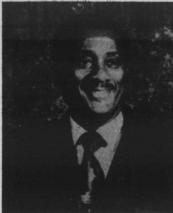
JOHN H. JOHNSON

John H. Johnson, publisher, businessman and humanitarian of Chicago, has been named to the International Executive Committee of Here's Life, planned as the most extensive Christian social and evangelization mission in recorded history.