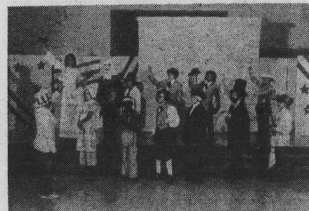
DEMOCRACY IN ACTION - Students at Sunrise Acres Elementary School put on an American historical play recently, entitled "This is Your Life Uncle Same." Roles of students involved in the projection included everything from America's first President George Washington, to a modern day portrayal of current U.S. President Jimmy Carter.