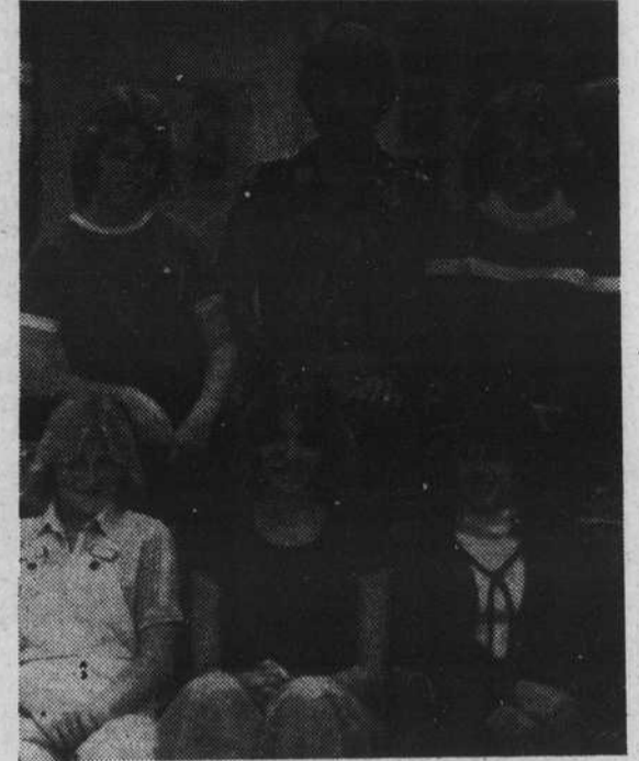
Brinley student council sponsored magazine drive and dance successfully and crazy week activities.