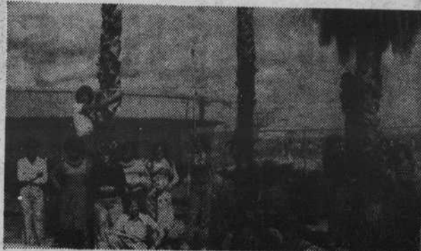
Brinley yearbook staff working to meet Bear Track deadline.