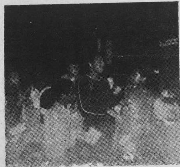
It takes a champion to cement the dreams of these boxing hopefuls.

Amateur Boxing: Young adults are trained in the art of boxing and participate in local competitions.