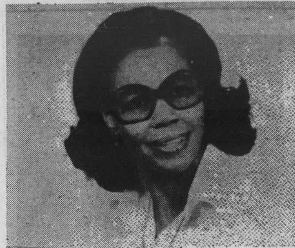
THE BRIGHTER DAY STUDIO Is offering Easter Fashions

My Lord, what a challenge! My Lord, what a hope! My Lord, what an opportunity for each of us to grow...and to become far better persons than we ever dreamed that we might be!