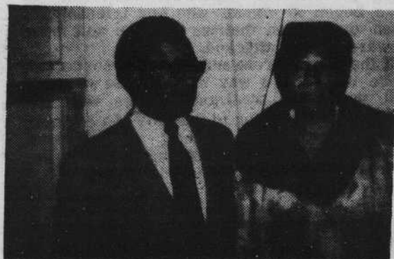
The St. John COGIC members are honoring their pastor and wife in their 13th anniversary Dec. 9 through 11, 1977.