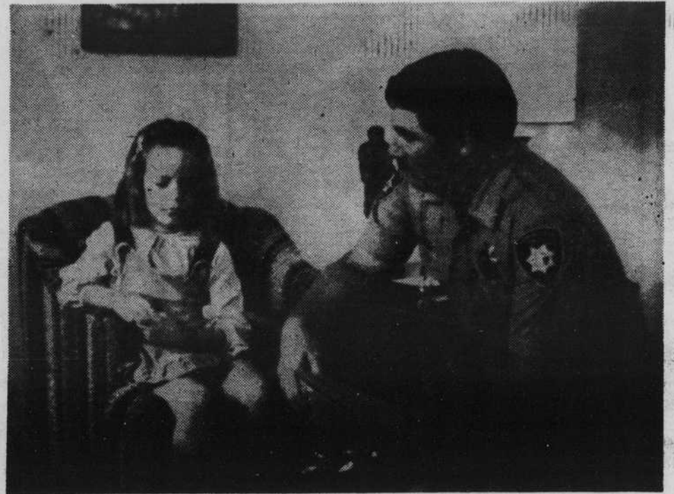
Interviewing child victims is one of the difficult problems law enforcement officers have when they investigate child abuse cases. This and other problems will be discussed when WE CAN's series on "Dilemmas in Child Abuse and Neglect" continues Wednesday night, October 12, in the Tropicana Hotel Plaza Room at 8:00 p.m. All programs are free to the public. The child shown here is a model and not a victim of child abuse.

"Dilemmas in Child Abuse and Neglect" is presented free to the public by WE CAN, Inc. through a grant from the Nevada Humanities Committee. For further information, call 732-8971.