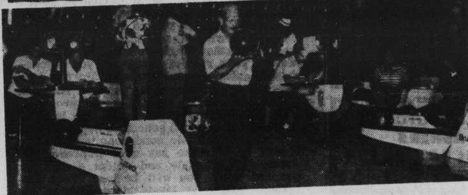
had swollen hands and lame legs because of not bowling for several years, but all felt it was time and effort well spent.