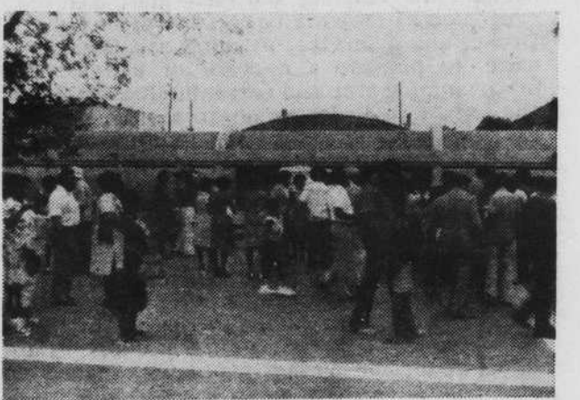
Some of crowd who marched in silence to M.L. King, Jr. Tomb at conclusion of S.C.L.C. Convention.