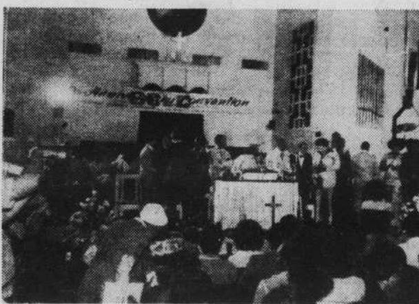
Jubilation on stage as nominees receive unanimous vote by acclamation avoiding any conflict at S.C.L.C. 20th Convention in Atlanta.