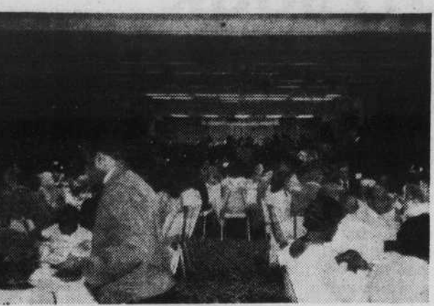
Part of over 1,500 who attended S.C.L.C. Banquet.