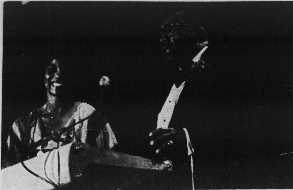
Olympian Wilma Rudolph makes a 1977 presentation of "Black Athletes Hall of Fame Award" to Ed Temple, her coach for the Olympics and a member of the U.S. Olympic Committee. Seven other sports figures in-

cluding Wilt Chamberlain, O.J. Simpson, Ike Williams were inducted. This entertainment extravaganza hosted by Bill Cosby will be seen on KVVU-TV 5 at 8:00 P.M. on Tuesday, August 9th.