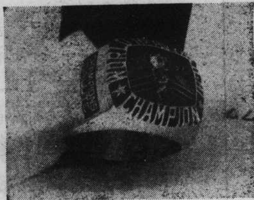
Pictured is the ring that will be presented to all of the former heavyweight champions

THE KING--Muhammad Ali, the current heavy-weight champ, will be honored along with past living heavyweight titleholders at the Las Vegas Boxing Awards to be held at the Aladdin Theatre for Performing Arts on Friday, May 20. Superstars of show business will present awards to such greats as George Forman, Joe Frazier, Ingemar Johansson, Floyd Patterson, Jersey Joe Wolcott, Max Schmeling, and Jack Sharkey. Las Vegas's own fabled Joe Louis will also be honored by scores of celebrities in this exciting night to remember. Tickets are on sale in several locations including the Aladdin Boxoffice and the Las Vegas VOICE Newspaper office, 616 N. H. Street. Prices $10, 20, 50, and $100.00