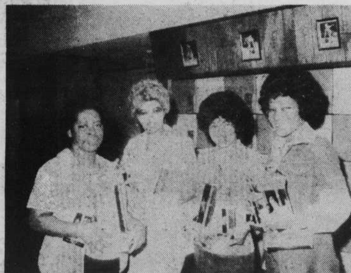
CONGRADULATIONS TO THE STRIKE OUTS -- 1ST Place Winners of the Col- legettes Bowling League.