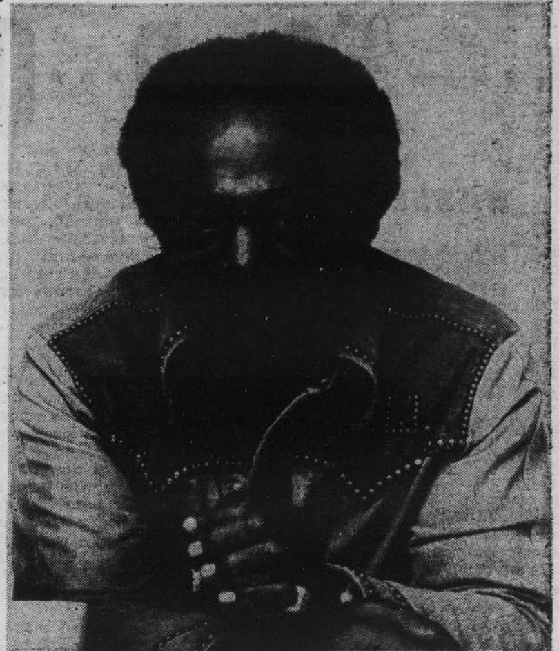
BLUE NOTE ARTIST

The words of Jimmy Witherspoon, who is testing the big time again with LOVE IS A FIVE LETTER WORD, are powerful and oozing with feeling. He knows the blues; he's suffered with them. And he's been able to resurface bringing the only music he knows with him.